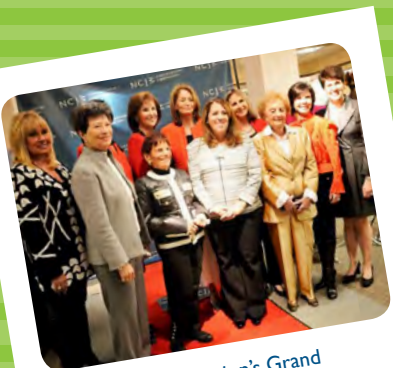
The St. Louis Section's Grand Opening & Building Dedication was a lively event featuring guest speakers, modeling, makeovers, hors d'oeuvres and wine! NCJW's volunteer models pose here at the dedication ceremony.